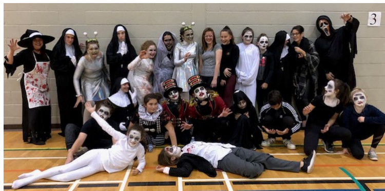
More than 20 people played roles in the Beaubassin-est Haunted House.