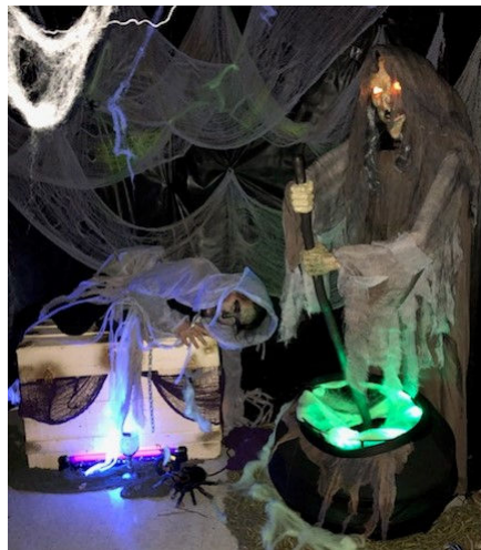
One of the scenes of the Haunted House, you can see more pictures on the Beaubassin-est Facebook Page!