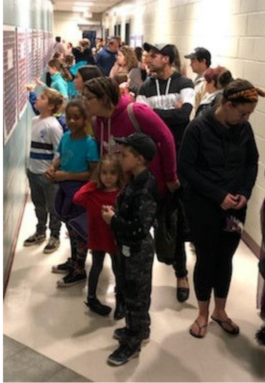
There were many people at the door of the Haunted House.